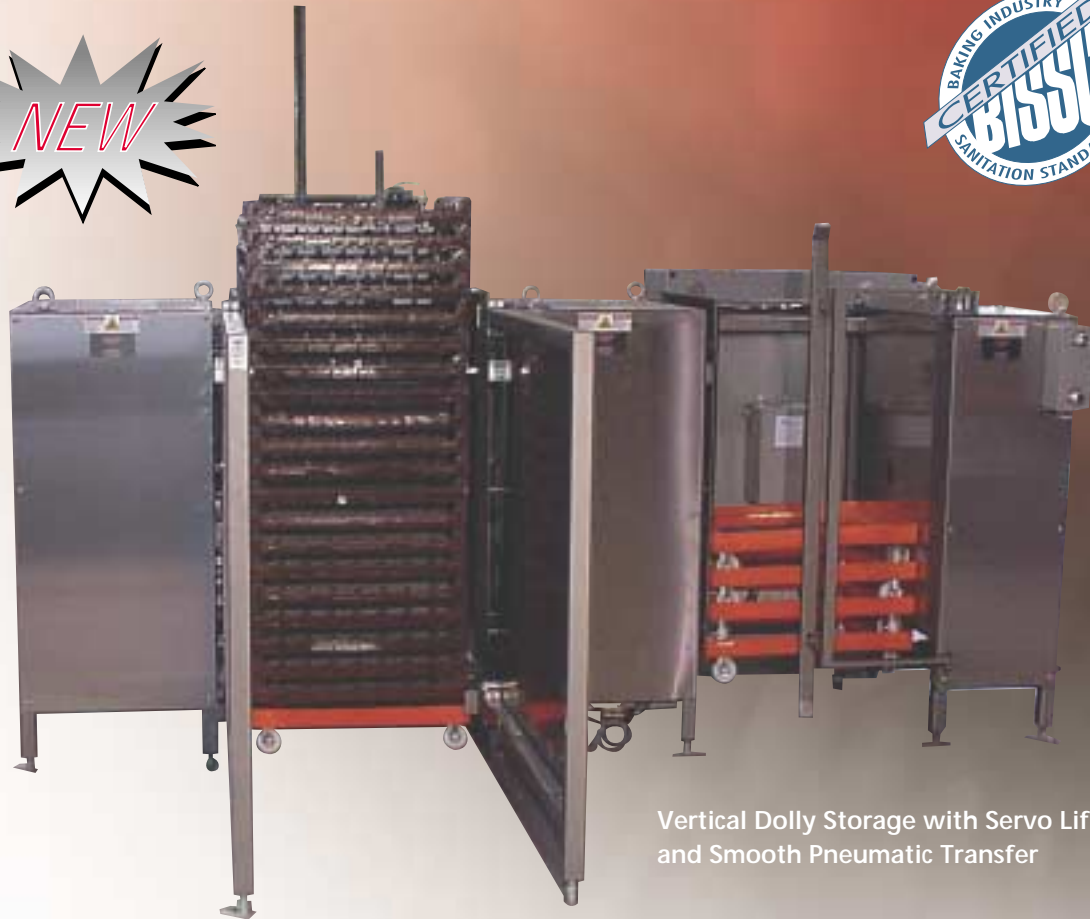
Vertical Dolly Storage with Servo Lift and Smooth Pneumatic Transfer